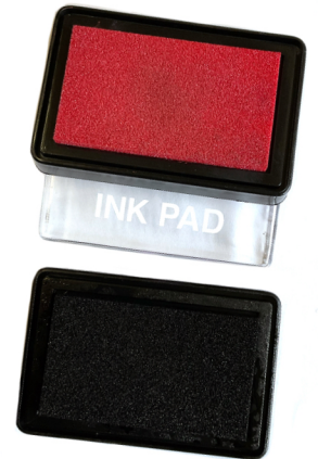
Ink pads and paper