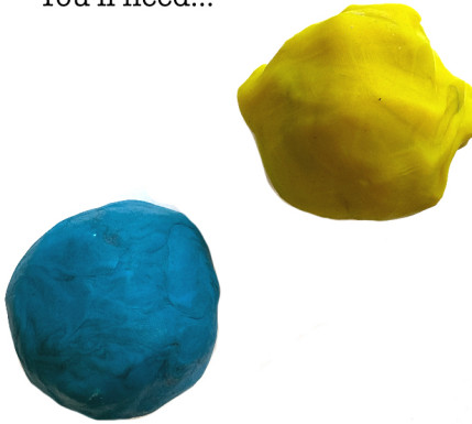
Play dough in any colour