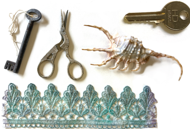
Textured shallow objects